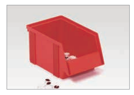
The design, with a half-open front, allows excellent visibility and easy access to the bin's contents, making it easy to pick from.