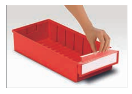
A label with a protective shield is easy to clean and change when necessary. The shield and label is included.