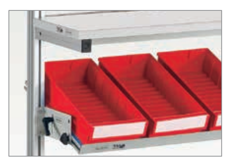
Shelf bins are designed to fit all metric shelving systems.