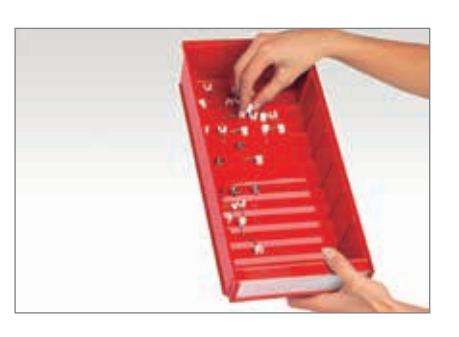
Corrugated base stops items from sliding on the surface and makes picking up small items easy.