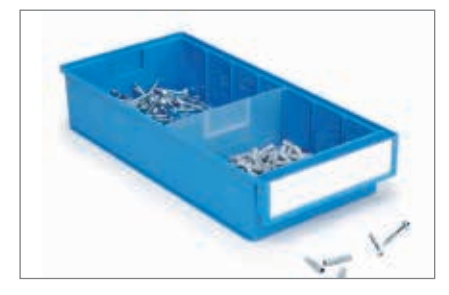
Individual bins can be sub-divided internally using dividers. Dividers are ordered separately.