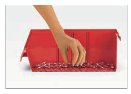
A corrugated base stops items from sliding around on the surface and makes picking them up easier.