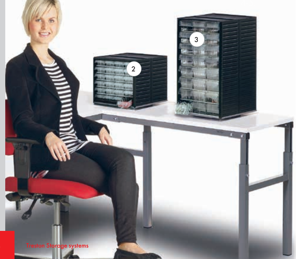
Figure 1 1 x spacemiser 12-550 4 x visible storage cabinets 551-3 4 x visible storage cabinets 554-3 4 x visible storage cabinets 557-3

For information on visible storage cabinets, see pages 4-5.